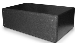
(16 3/4" W x 10"D x 5 1/4" H)

A handsomely styled Stand Alone version of the "Stair Riser"-incorporating the same high performance components and yielding the same performance specifications. The NF-241HP 2 Stand Alone utilizes 3/4" birch plywood with a painted textured finish; rounded corners; and a fabric grill. Additionally, mounting points have been incorporated into the cabinet sides for bracket use installation. Optional finishes available.